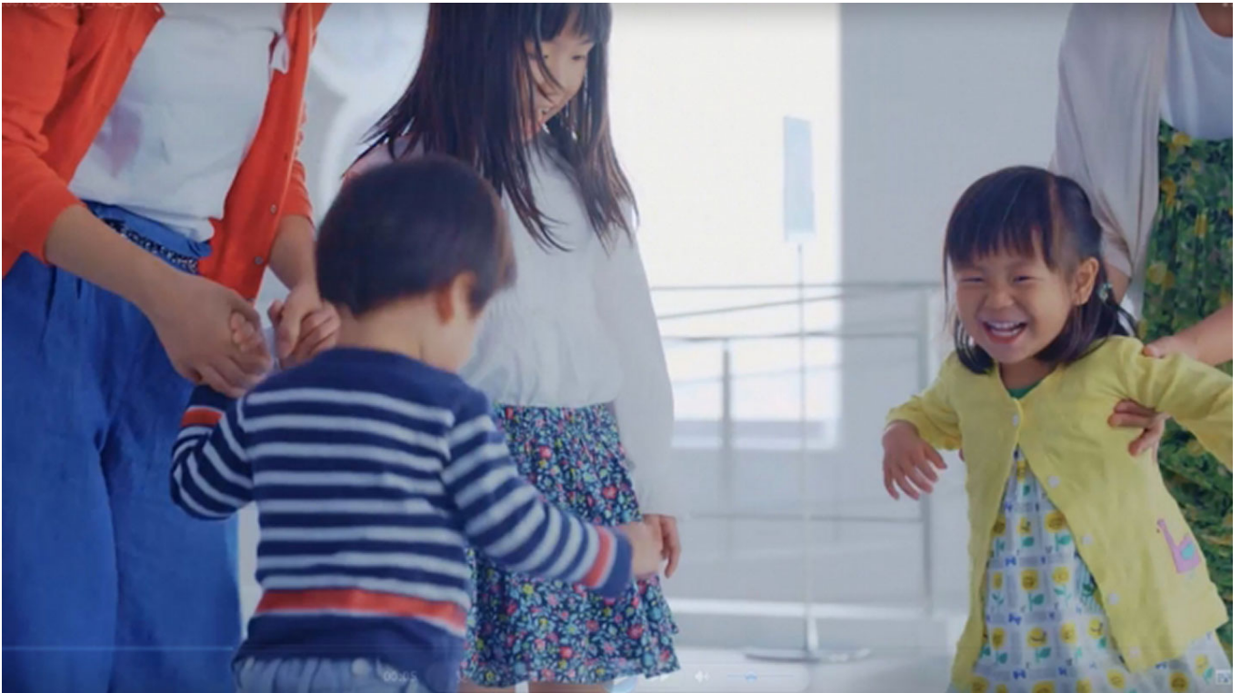
From the press release "The 50th Anniversary of Sunshine City Inc. Special Campaign: Free Entry to Observation Deck for Children Under 12," Sunshine City, Inc., September 30, 2016.