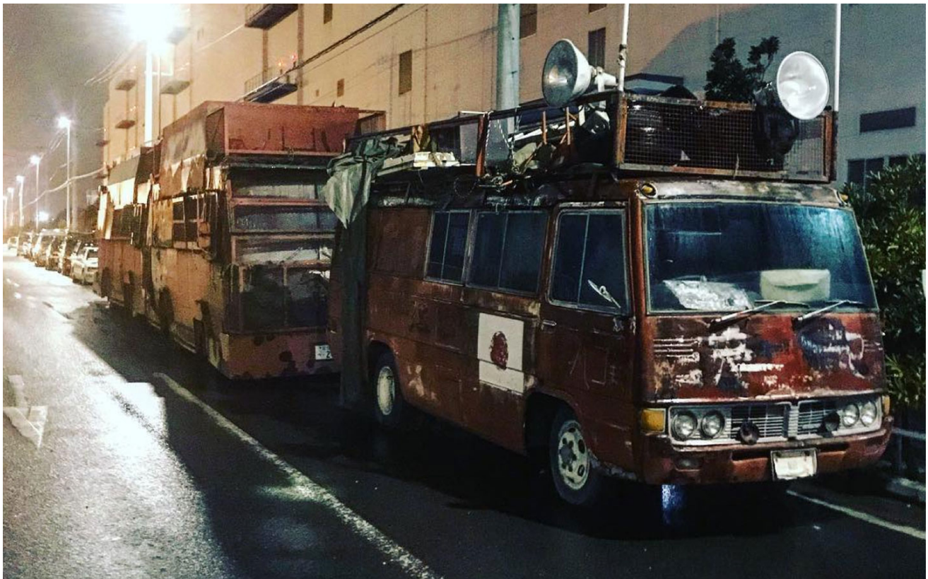
Abandoned nationalist campaign cars worn out after decades of intense use. In the foreground, a first generation model of Toyota’s coaster (1969-82).