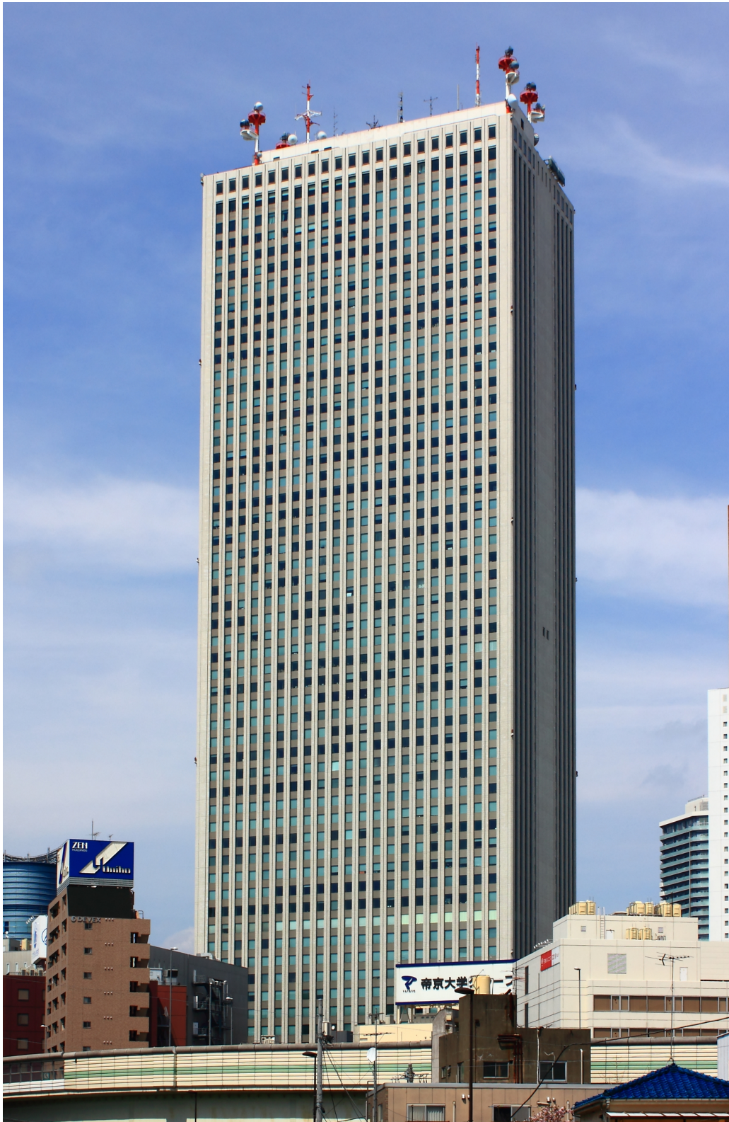
The Sunshine 60 building, built in 1978, is a 60-story, mixed-use skyscraper located in Ikebukuro, Toshima, Tokyo. At the time of its construction, it was the tallest in Asia.